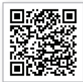
Android QR code for PowerPal App

W e work hard to ensure your power stays on 24/7, but when outages do occur, we want to make it easy for you to let us know! With the Tri-State EMC PowerPal app, you can report a power outage with just a few taps of your finger, view multiple accounts and sign up to receive push notifications about power outages and restorations. Download the app today!